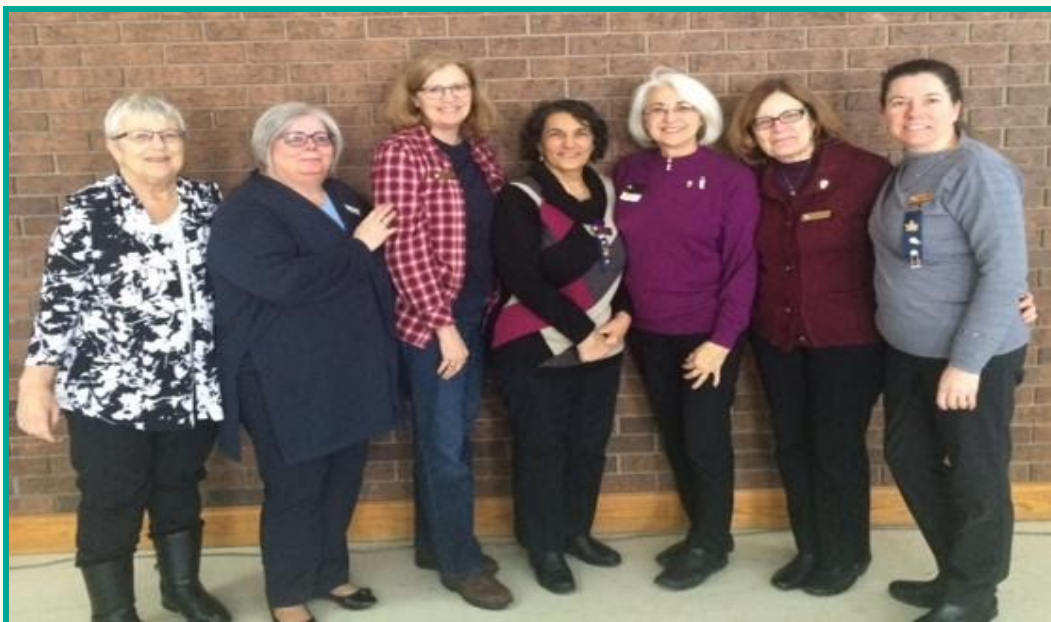
Members of the Ingersoll Region at the Lenten Retreat 2020