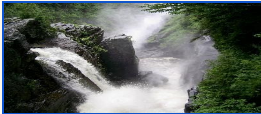
Life-Saving Water-Keep it Clean!

But, today I need to write about other serious issues no doubt we are all living with the fall-out of the covid-19 virus. Also I know we are being sensible and following the directions of our Health Departments and we are trying to stay safe and not get infected, but also to make sure we are not endangering others. I stay at home, If I have to go out I am wearing a mask and gloves.